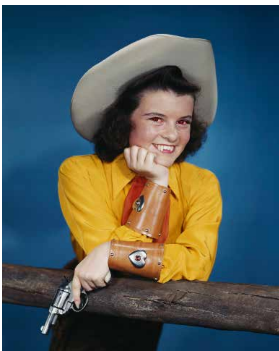
Stone louse, from the series Encyclopaedia, 2023-2024 Near Dark, from the series Encyclopaedia, 2023-2024