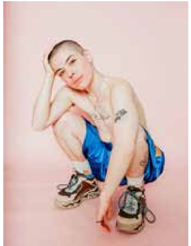
© Jeannette Petri, Beyond Binary , laif