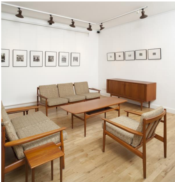
Collection Regard, Berlin