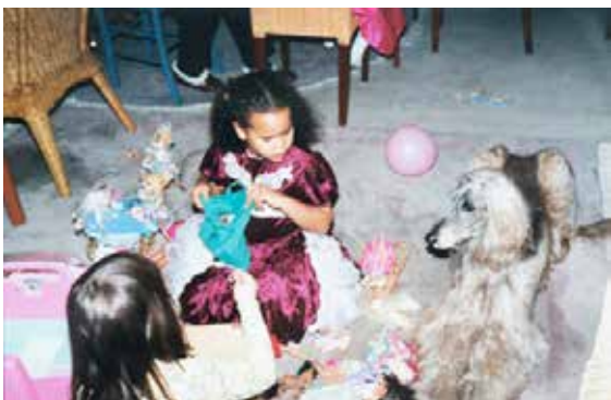
© Verdiana Albano, i ain't from no east coast , 2024

When you're constantly asked where you come from, it leads you to think more deeply about it.