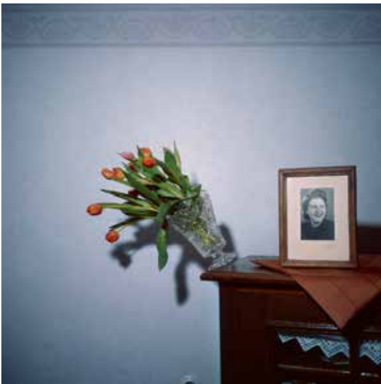
© Alex Bex - Memories of Dust