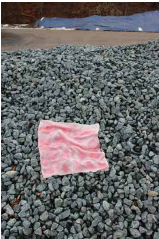
© Antonia Elsa Karnetzky / HfG Offenbach

FOTOHAUS is an exhibition concept launched in 2014 by the ParisBerlin>fotogroup that highlights the Franco-German photography scene by focusing on crossed views around a common theme. FOTOHAUS aims to open the borders for a dialog between cultures and territories. This collaboration between the partners aims to bring together the players in German and French photography and to create a space for exchange and synergies between institutions, photographers, galleries, collectors, agencies and publishers.