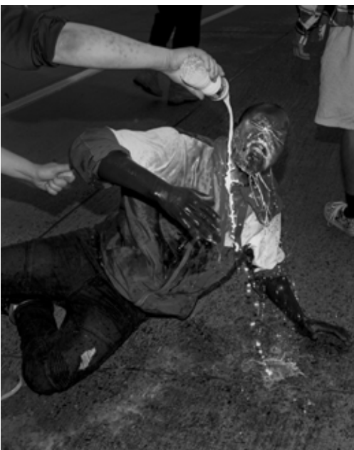
Untitled, Minneapolis, Minnesota, May 2020