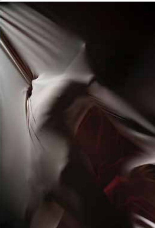
Natalia Dymkowski, Untitled, 2020

On the occasion of the project Persona of FOTOHAUS, CHAUSSEE 36 presents a selection of works of its group exhibition EROS & PHOTOGRAPHY - Part I: Behind Desire , seeking to introduce eroticism, the Art of Desire, and to examine its different facets in artistic photography.